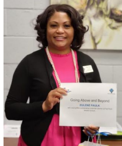
Above and Beyond